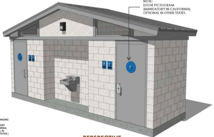
PERSPECTIVE (FINISHES SUBJECT TO CHANGE) RESTROOM BUILDING