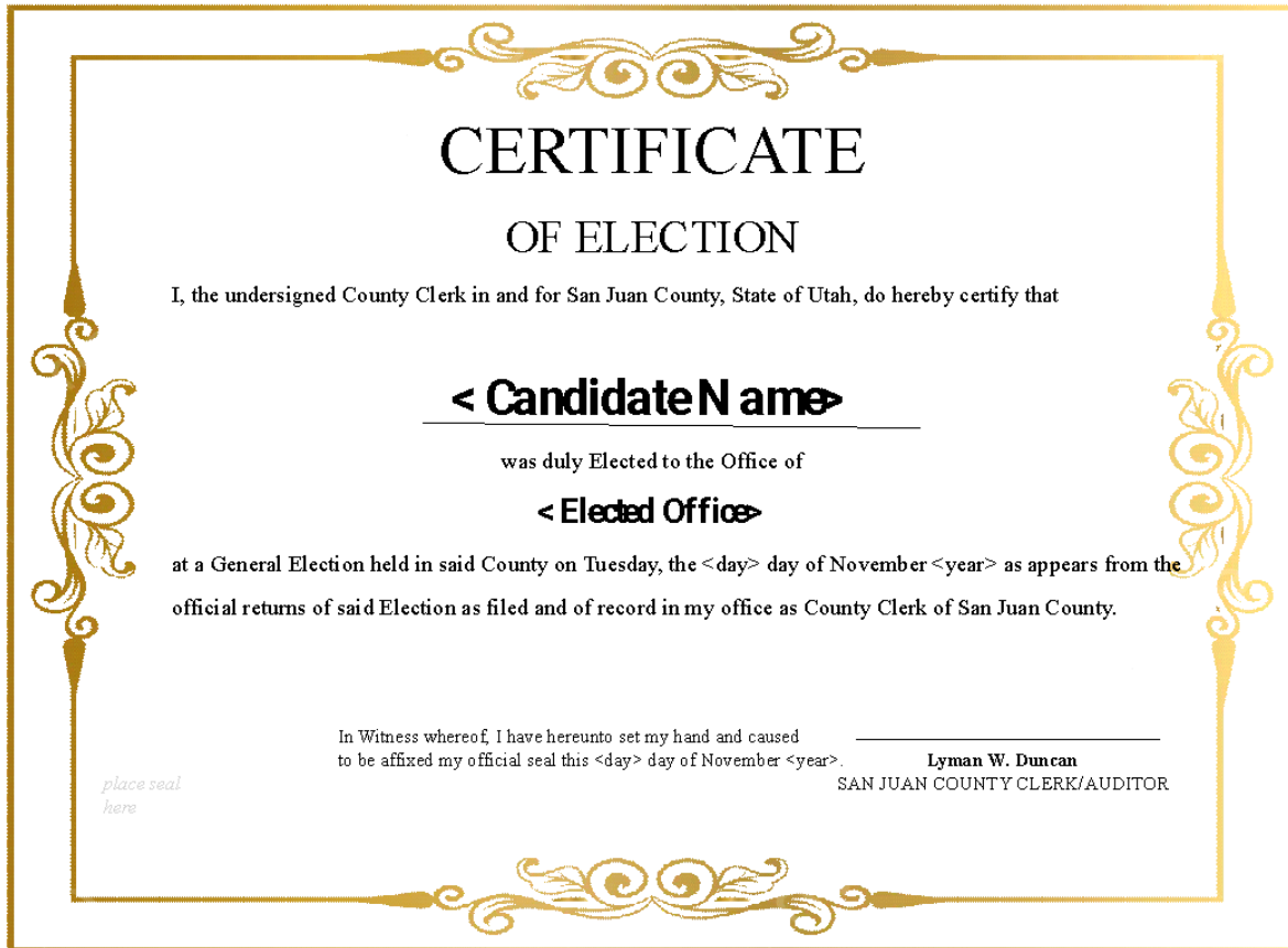
EXHIBIT E CANDIDATE CERTIFICATE EXAMPLE